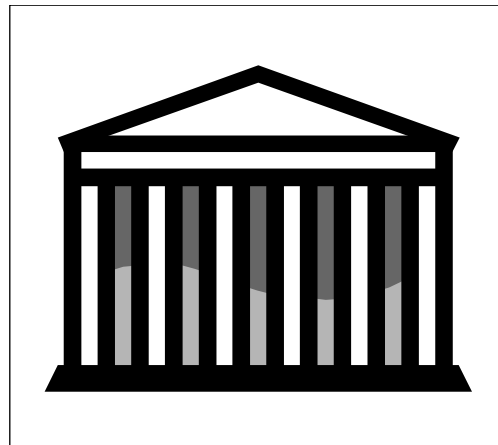
Caption describing picture or graphic.

A listing of names and titles of managers in your organization is a good way to give your newsletter a personal touch. If your organization is small, you may want to list the names of all employees. If you have any prices of standard products or services, you can include a list-